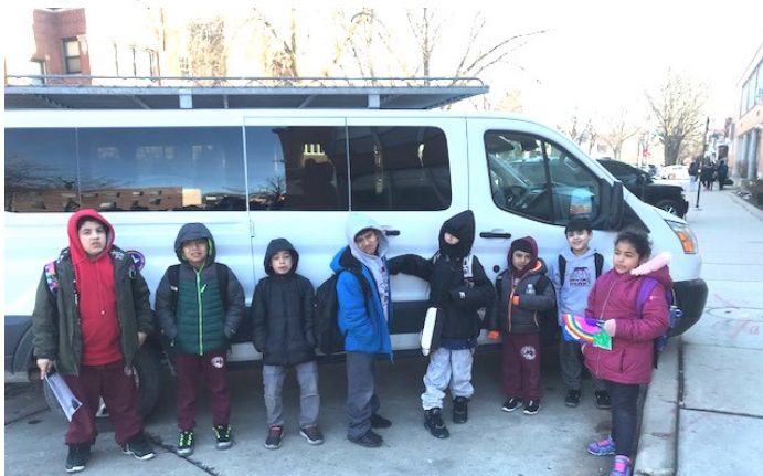
CICS Irving Park kids love getting picked up each day to come to NBGC in the van. They especially enjoy the 1pm Wednesday dismissals each week.