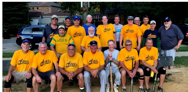
Current ACES 55 & Over Team