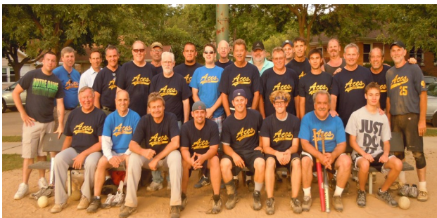
ACES Fathers & Sons Playing Together!