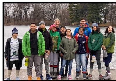
NBGC Leaders & Chicago Voyagers