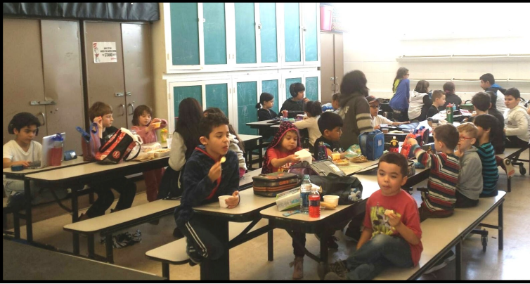
NBGC kindergarten & 1 st grade members enjoying lunch while being safe & warm at the Clubhouse