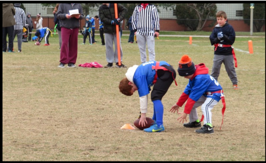
Boys Flag Football