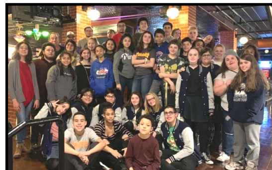
NBGC Leaders & Staff at Dave & Busters