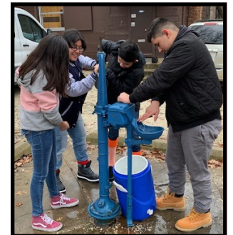
NBGC Leaders pumping drinking water