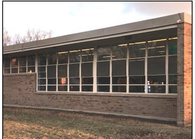
NBGC & Revere Park have been awarded $6 Million in TIF funds for some much needed building renovations