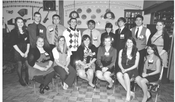
The 2013 Leaders of the Future Class