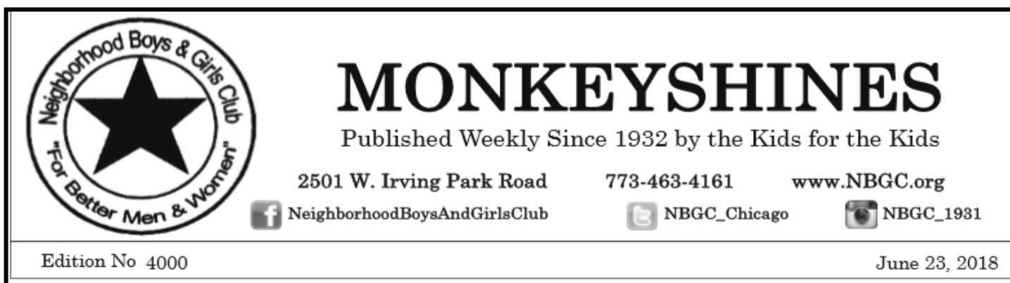
The most recent header we use.