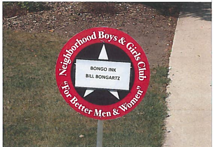
Sponsor signs were posted around the course!!!