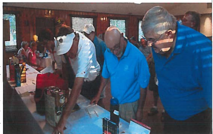
Table prizes have become a favorite tradition at the post golf party.