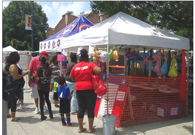
Ribfest goes line up at the NBGC Kids Square Booths

The entire NBGC community congratulates the NCC on another successful Ribfest and extends a sincere Thank You for the opportunity to participate in the Volunteer grant and the Kids Square.